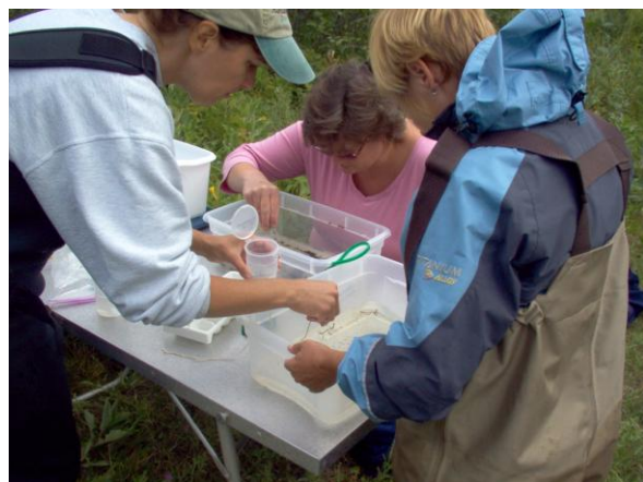
In the field, eager teams work to complete a macroinvertebrate collection at a River Day Event.