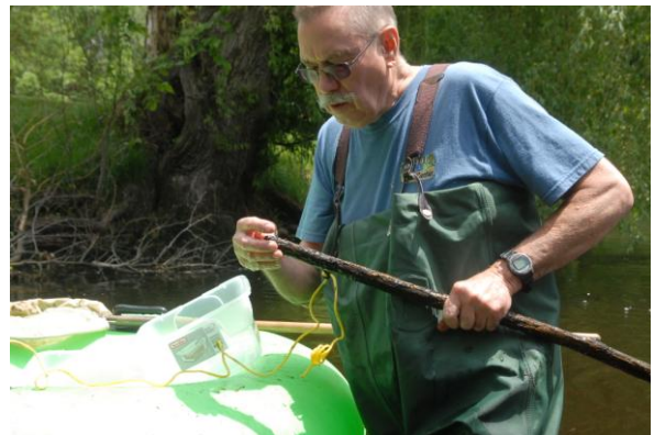
Collecting every single bug adds up to a very successful Bug Day Event.