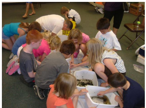
A special bug picking day at the public library. It's so much fun, even kids can do it.