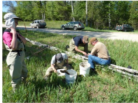
Along Portage Creek, a major tributary to the Manistee, volunteers collect samples during the May 2010 event.