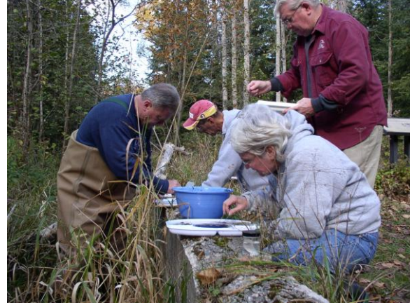
Volunteers from the Pine River/Van Etten Lake Watershed Coalition pick samples during their first event.